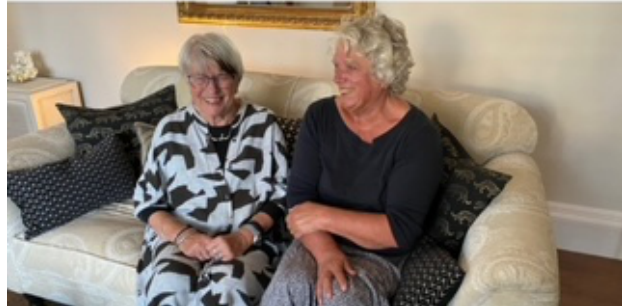
Meet the Team