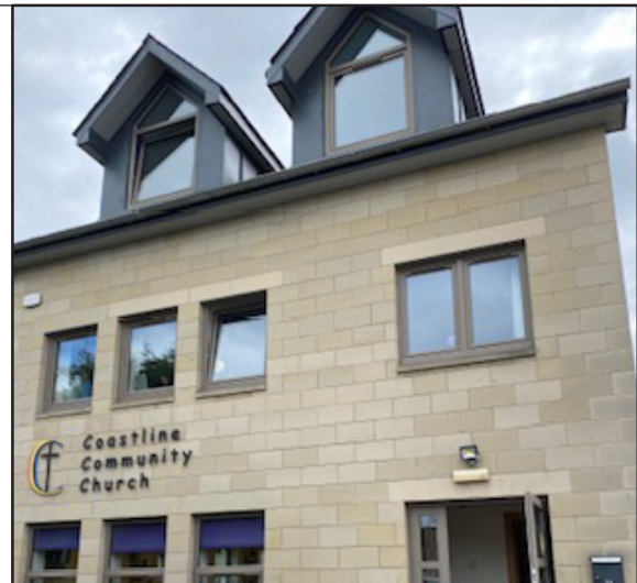
Coastline Community Church, Session Street on its tenth anniversary in 2023