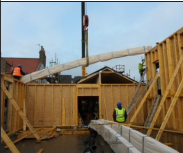
Building work in progress in 2013

A special time of thanksgiving as part of a series on 'The Power of Worship' was held in the church recently on 19 August 2023. The theme was 'gratefulness' and the congregation gave thanks for the first 10 years of use of such a wonderful building!